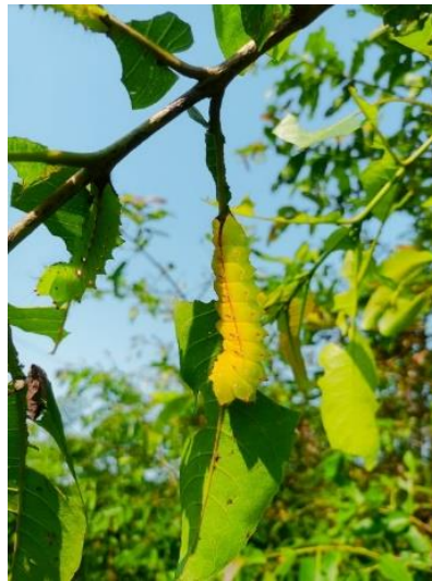
Fig. 2 Outdoor photograph of Mulberry silkworm ( Bombyx Mori L ) Larvae at Farm beside Central silk Board Koni Bilaspur (C.G)