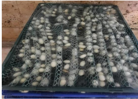
Fig. 1 Indoor photograph of Mulberry silkworm ( Bombyx Mori L ) cocoon at Central silk Board Koni Bilaspur (C.G)